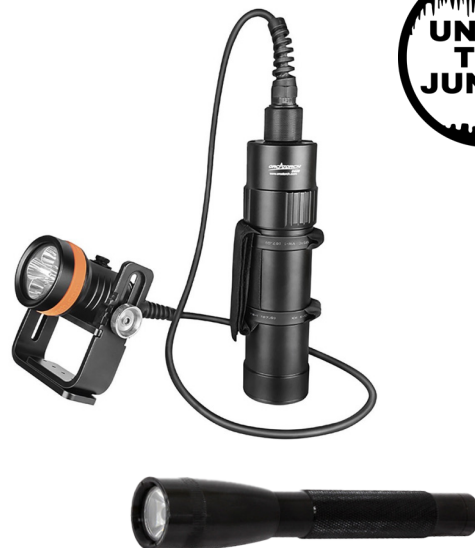
The OrcaTorch canister light and Big Blue AI250 back-up light.

A reel or spool with a minimum of 40 meters/ 130 feet of line and a back-up are required.