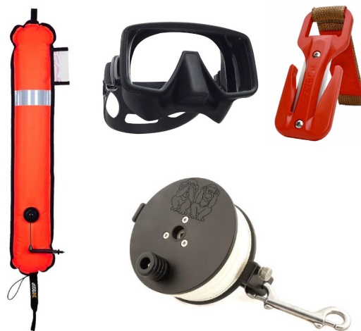
Example accessories, not to scale.