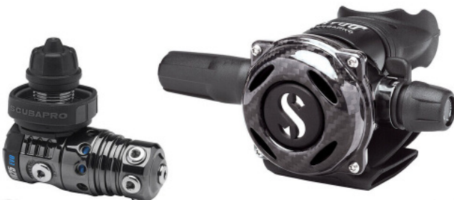
An example of a bailout regulator. Who doesn't love the ScubaPro MK25?

A bailout regulator with a DIN first stage, second stage on 2-meter/7-foot long hose, an SPG or a transmitter (no button gauges), and an approximately 56 cm/ 22 in LPI hose. The long hose should have a small bolt snap attached close the second stage. When in doubt, bring what you have and we will help you to configure it -- it's part of the course! We sell hoses, SPGs and bolt snaps at the shop, and can rent you a regulator and/or a transmitter. You'll need two hose retainers to route the long hose along the side of the bailout cylinder, and we also sell those. We will provide the tank rigging as part of the course.